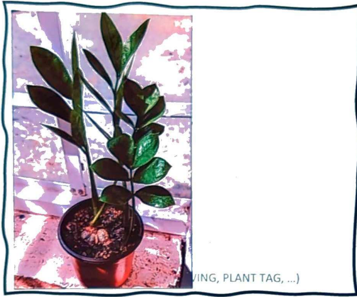
(WATERING, PLANT TAG, ...)